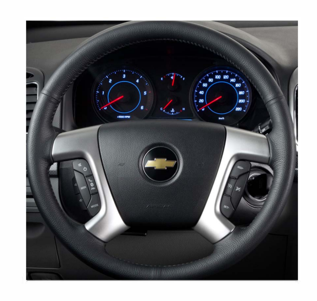
Steering Wheel Control Functions

For Vehicle Compatibility visit https://aerpro.com/FP9251K