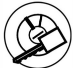
POSITIVE IGNITION OUTPUT

The interface generates 12 V Ignition feed upon engine cranking.